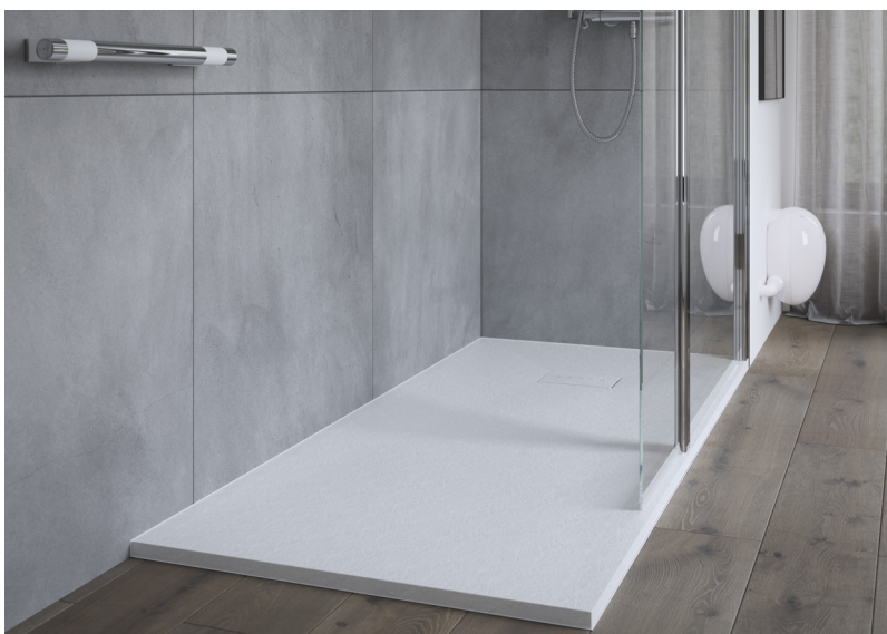
FastDEK installed on finished floor.