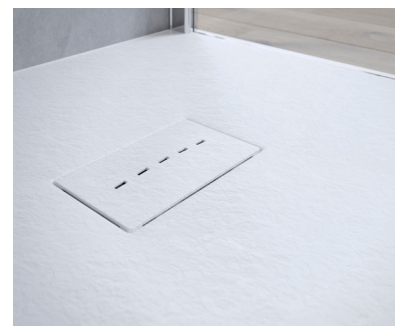
Drain cover detail.