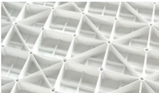
Ribbed underside detail.