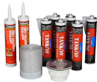
Color and surface texture detail.

Be sure to order a FastDEK installation kit: FB1000-IK.