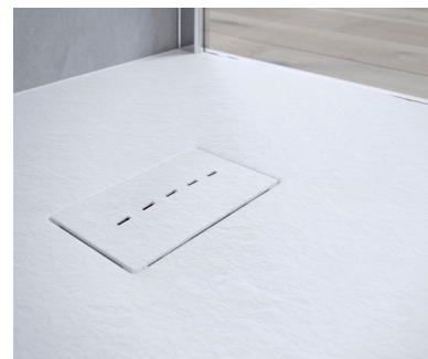
Drain cover detail.