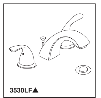
Submitted Model No.: Specific Features: