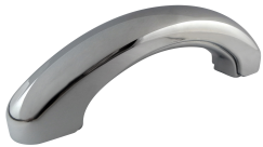
Standard Grab Bar