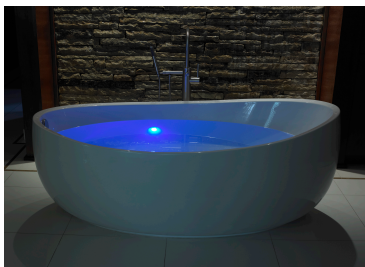
Chromatherapy-LED Lighting System