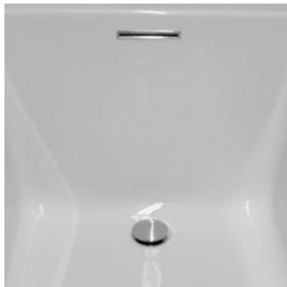
Linear Integral Waste and Overflow