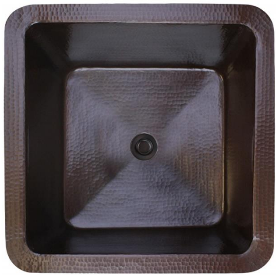
Shown in DB