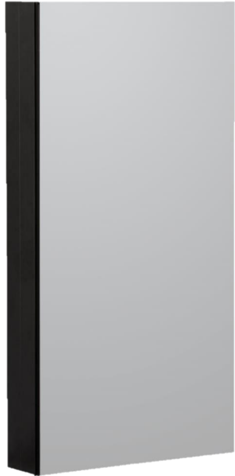
Black Pictured Above

**Please refer to the installation manual for cleaning instructions