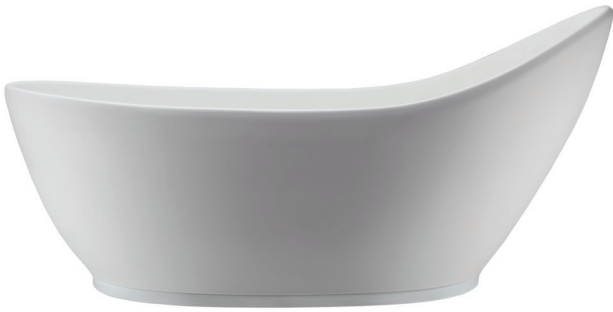
Features an integrated overflow.