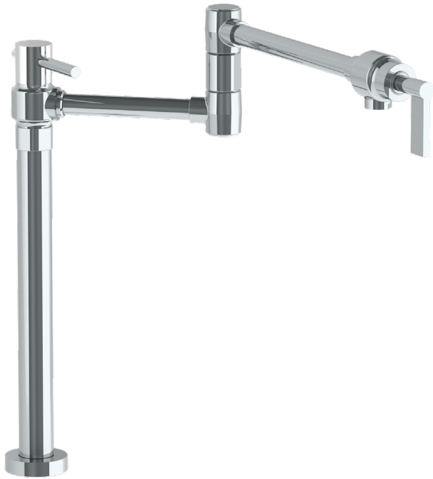
Blue 37-7.9-BL2 Deck Mounted Pot Filler